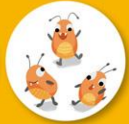
Lice 1, 2, 3